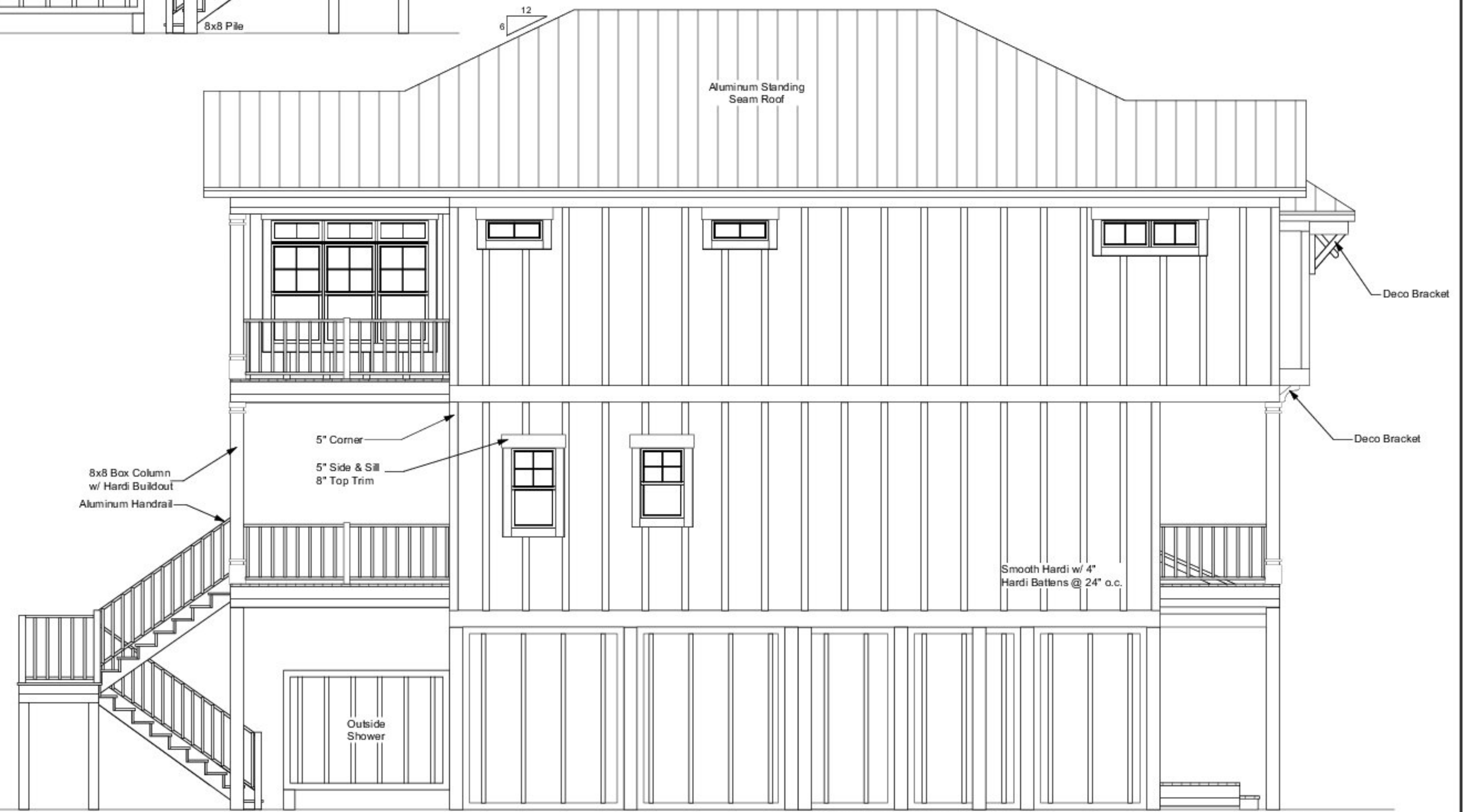
LEFT ELEVATION 6:12 Roof Pitch unless noted

Enclosure Walls are 2x4 @ 16" o.c. Hardi Panel - Smooth Finish w/ 2.5" Battens w/ Flood Vents 1 Sq Inch per 1 SF of Enclosed Area