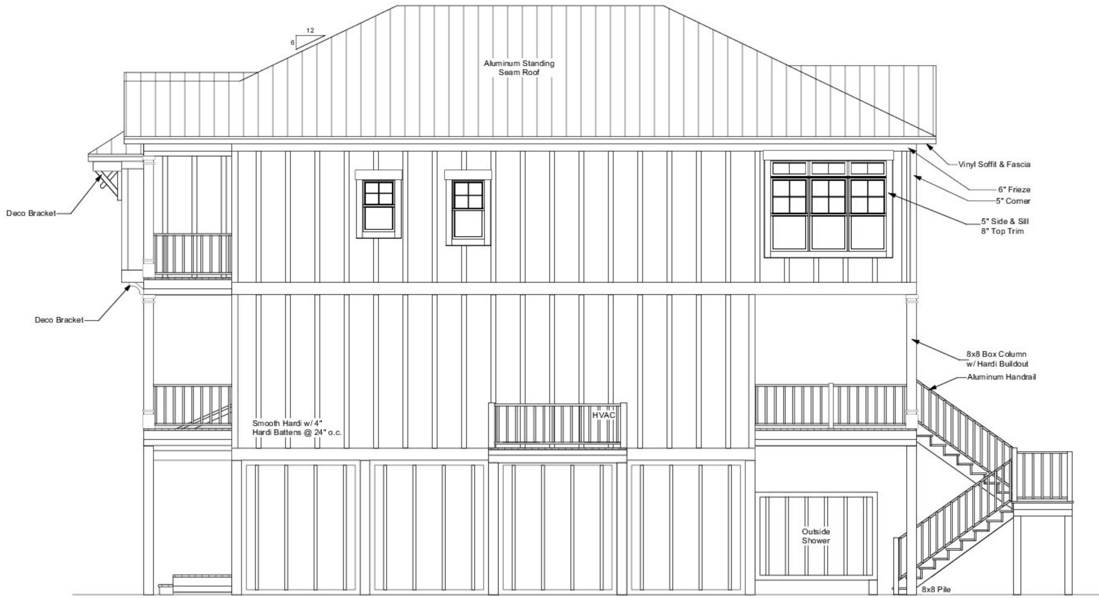
RIGHT ELEVATION 6:12 Roof Pitch unless noted

Enclosure Walls are 2x4 @ 16" o.c. Hardi Panel - Smooth Finish w/ 2.5" Battens w/ Flood Vents 1 Sq Inch per 1 SF of Enclosed Area